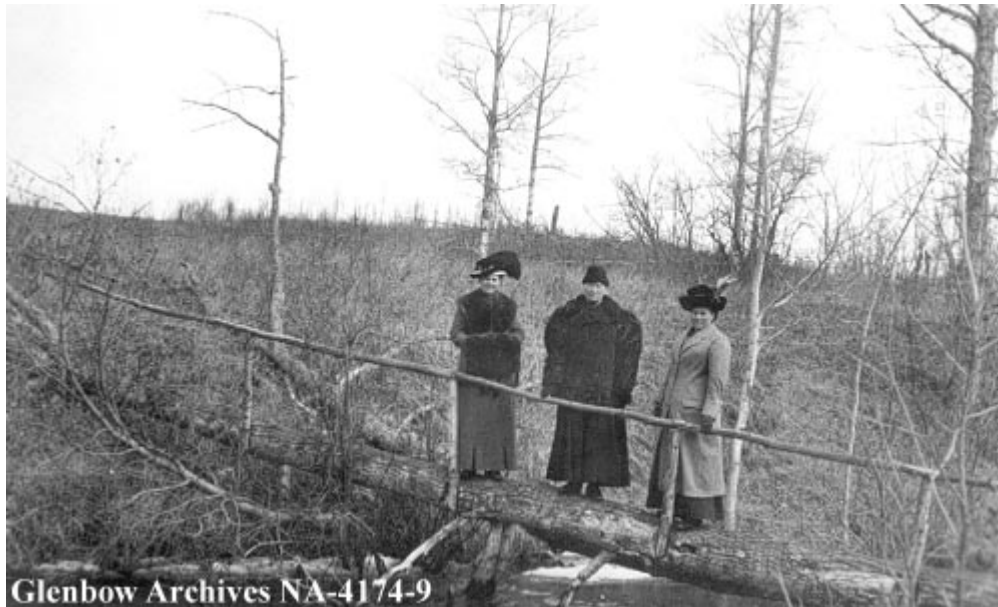
Glenbow Archives NA-4174-9

Early 1900s Creek crossing near Rosehill school, Calmar area, Alberta. Three ladies standing on tree trunk used as crossing. Rosehill was the first school built in the Calmar area.