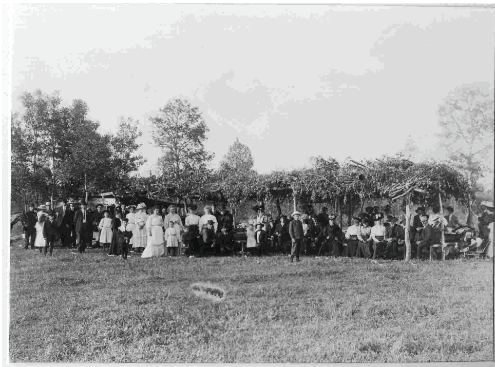
Early 1900s. A group picnic. This photograph, in mural form, is situated on the north side of the pump station in Woodland Park.